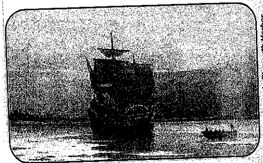
The Mayflower in Plymouth Harbor

What details in Of Plymouth Plantation suggest the kinds of challenges the travelers faced on the journey? What other challenges do you think travelers might face on a ship this size?